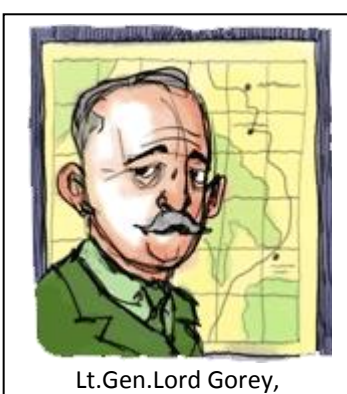
Lt.Gen.Lord Gorey, Fourth Earl of Dampshire

Spring 1918. Despite a number of ups and downs, the war has been going well for the Premier Escadrille International. A top secret conference was called by Lt. Gen Lord Gorey, Fourth Earl of Dampshire at his family home, Dampshire Court, in England to discuss augmenting the Premier Escadrille International by an additional two squadrons as the Premier Escadre International.